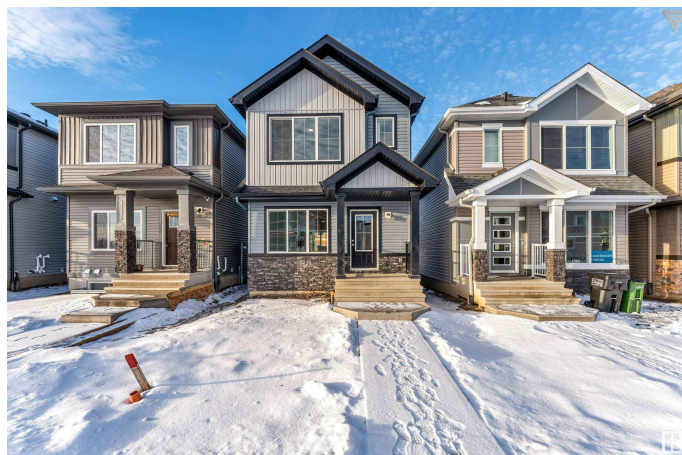
9574 Carson Bnd SW, Edmonton, AB

MLS® # E4416797 Price $485,000 Bedrooms 3 Bathrooms 2.50